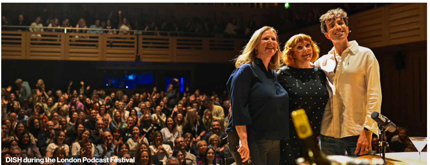
DISH during the London Podcast Festival

As we look ahead, we remain dedicated to championing the past, present and future of the arts whilst serving our ever-important audience base. Thank you for being part of this journey—we couldn't do it without you.