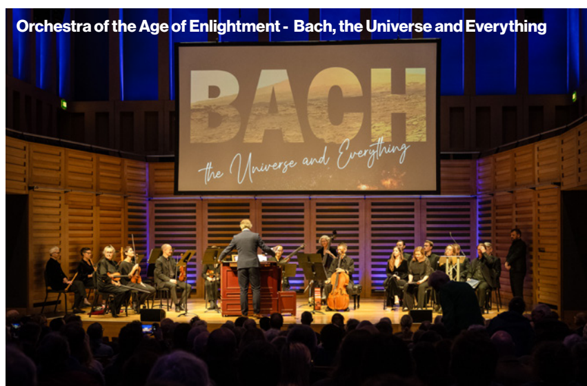
Orchestra of the Age of Enlightenment - Bach, the Universe and Everything

In our classical programme, series such as London Piano Festival , Piatti Quartet: Soundbites , and Bach, the Universe and Everything , continued to bring world-class performance to Hall One while surfacing neglected composers and exciting new performers.